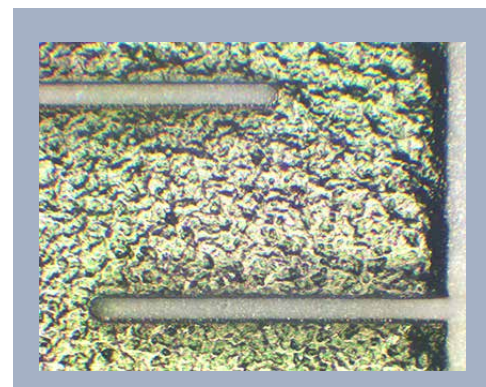
Two plunges of a serpentine trim in thick film material.

The following is the analysis of time consumed and cost for each high-level step in their thick-film trimming process with a traditional probe card system and the modern RapiTrim fixtureless system. The RapiTrim design uses four flying probes to access anywhere in the 50x50mm process field of the laser. Assignment of probes to test pads is performed automatically by the software, avoiding any shadowing of a resistor by the probe arms.