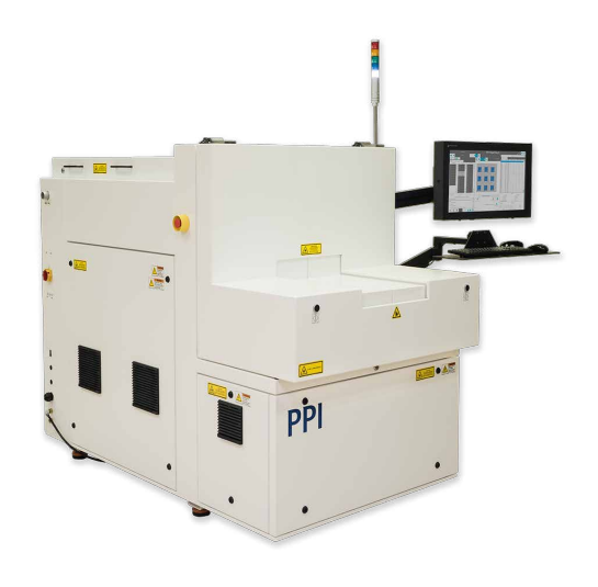
RapiTrim The Future of Resistor Trimming™